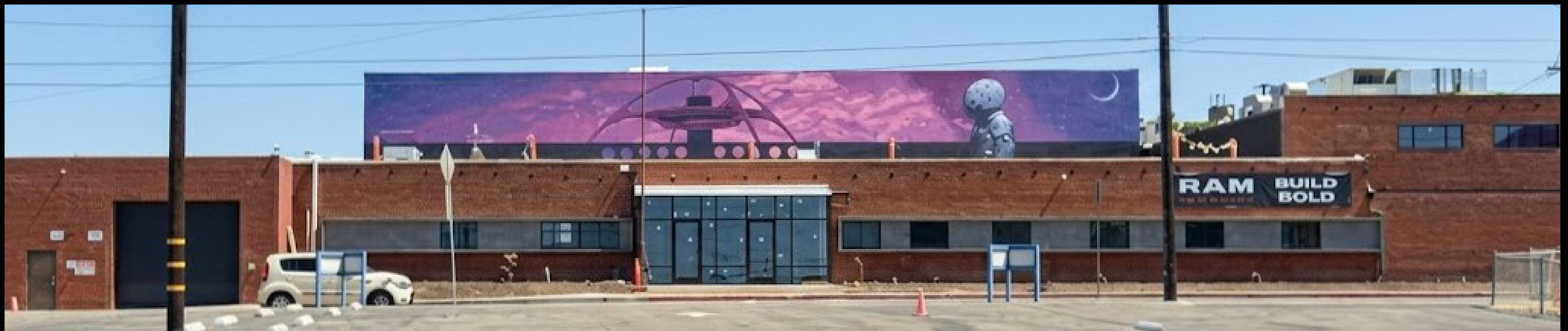
On-site Artwork by Brickworks at Smoky Hollow