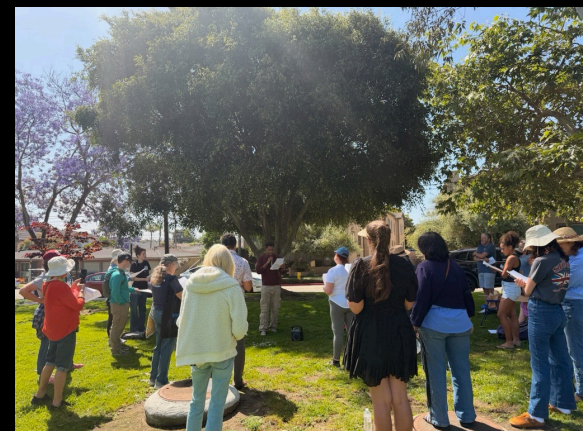
Literature Arts Program