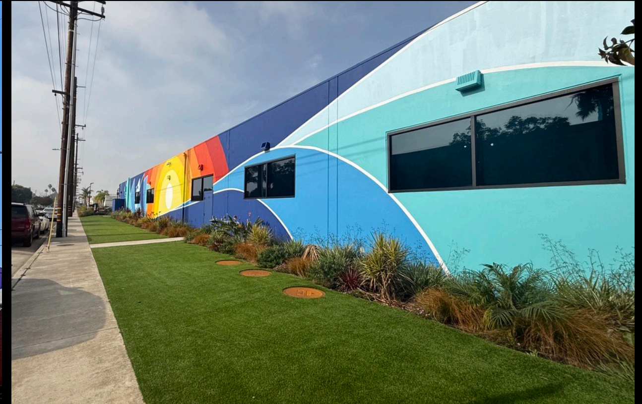
On-site Artwork by Calismash