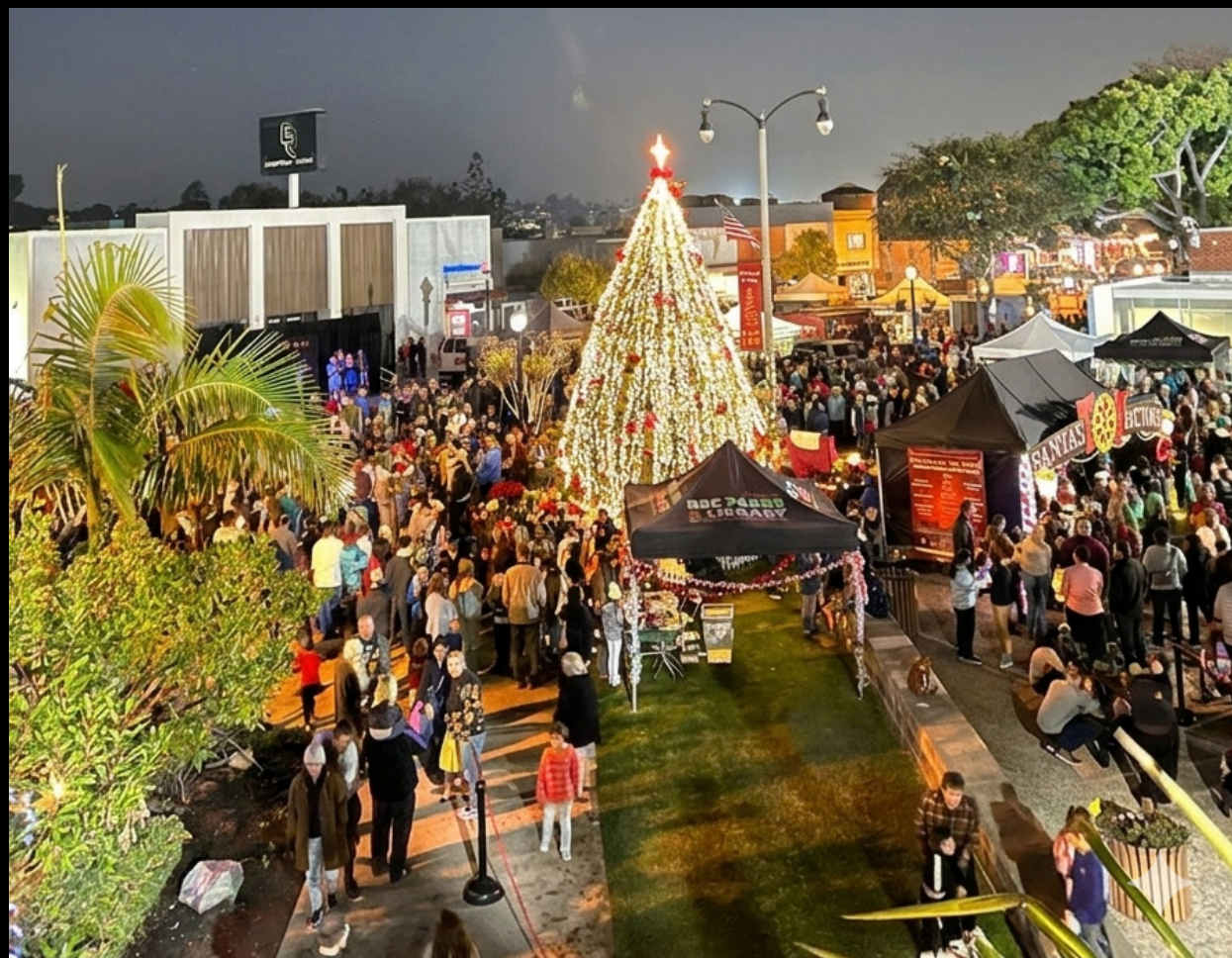
Joy Around the World