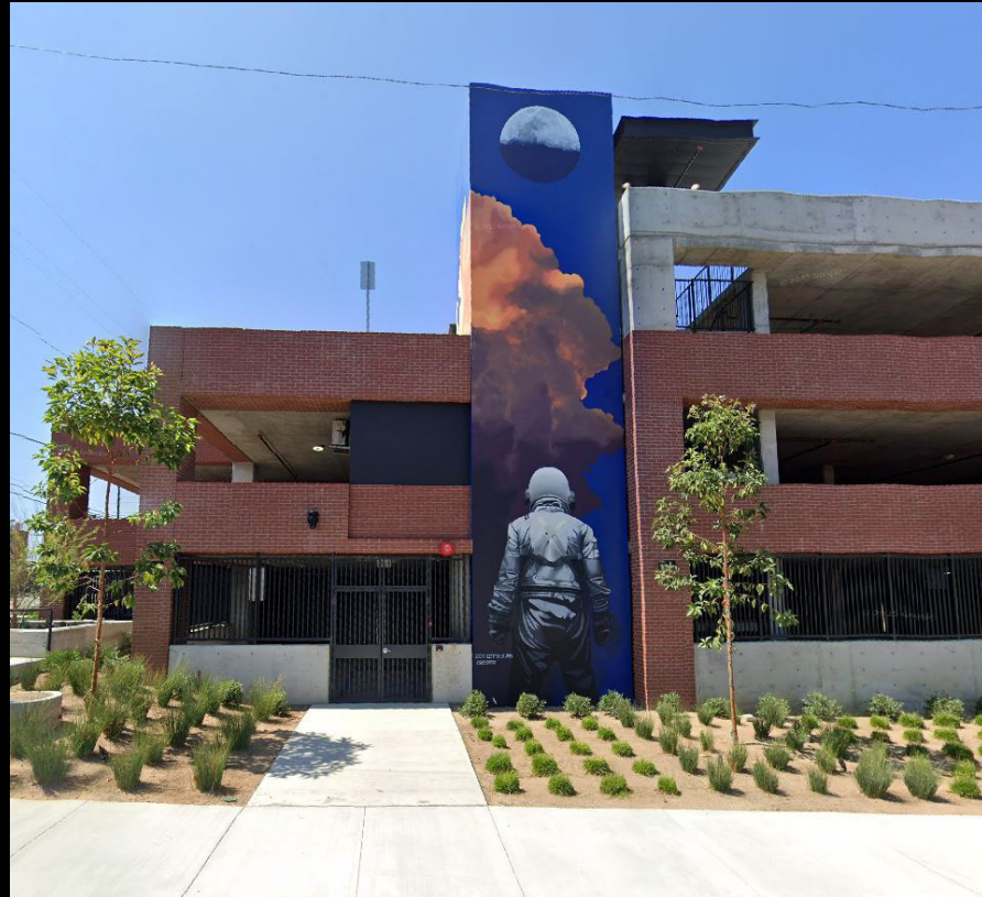
On-site Artwork by Brickworks at Smoky Hollow