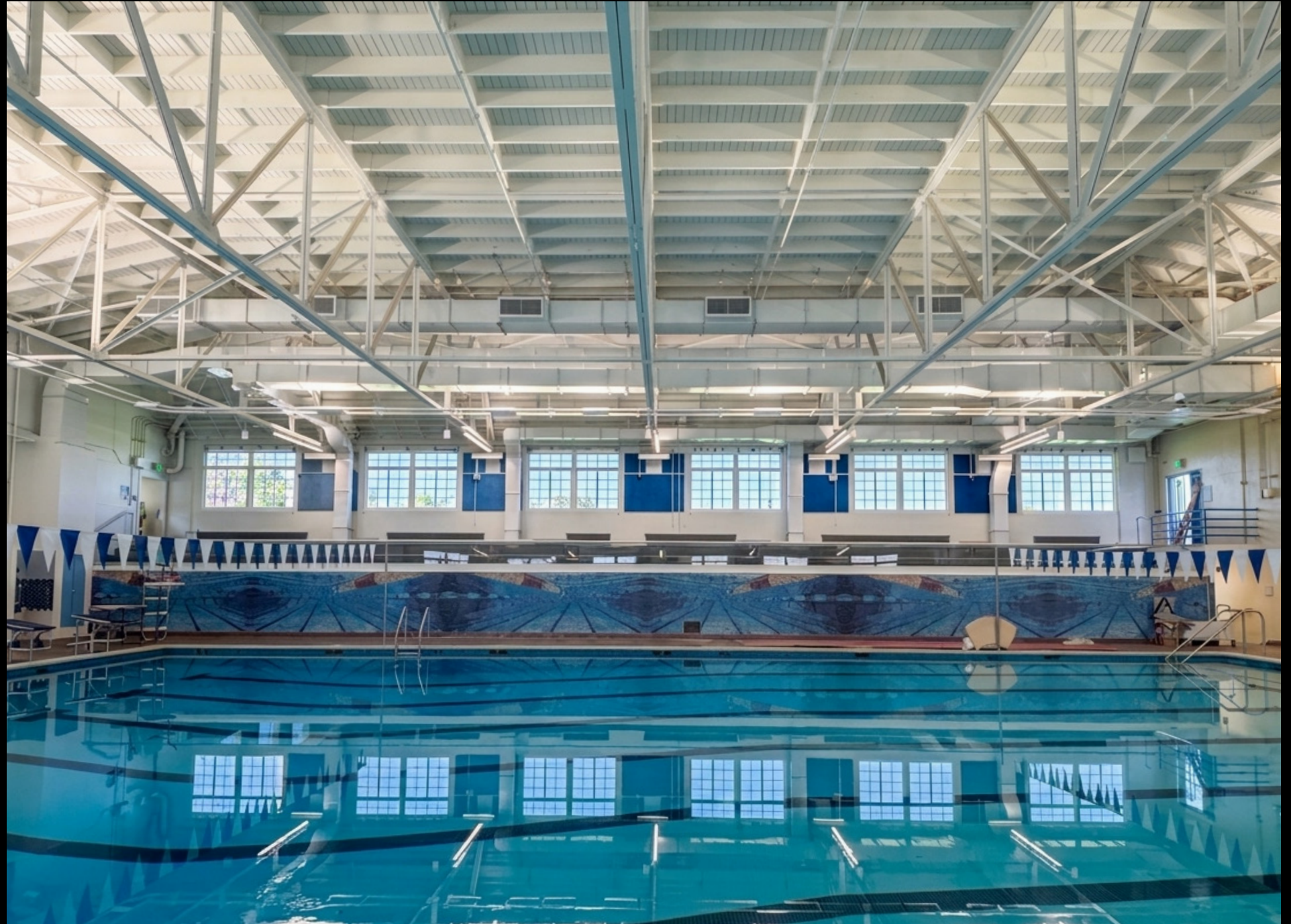
Plunge Mosaic Wall Mural