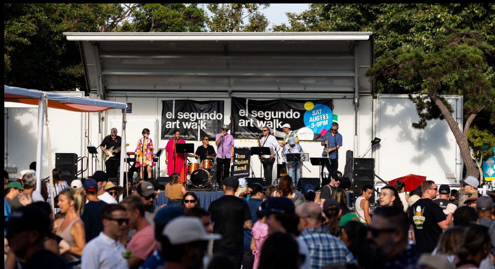
El Segundo Art Walk